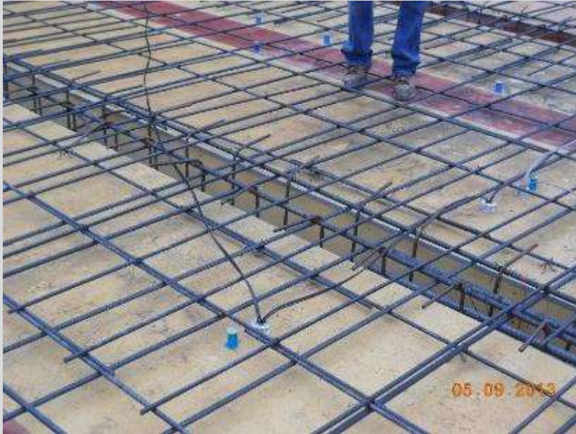
Temporary lighting power cables installed within concrete slab