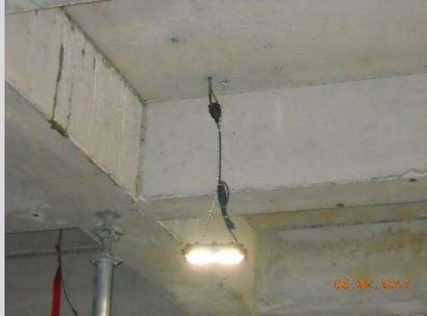
Temporary lighting whips and light fixtures dropped and exposed below ceiling deck