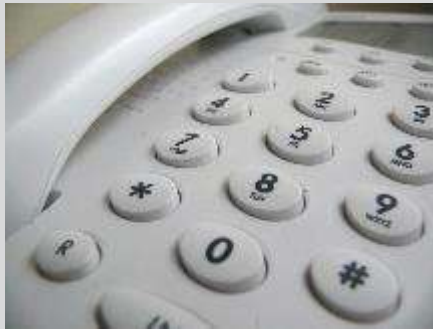
Interview with Clear-Vu representative