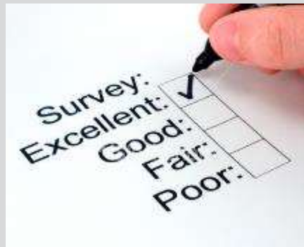
Survey questionnaires distributed to workers on site