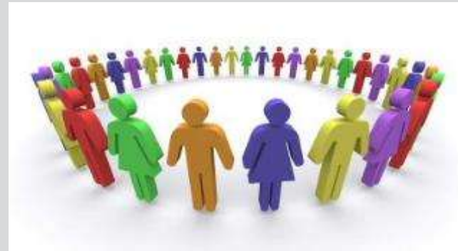
Site interviews with project staff