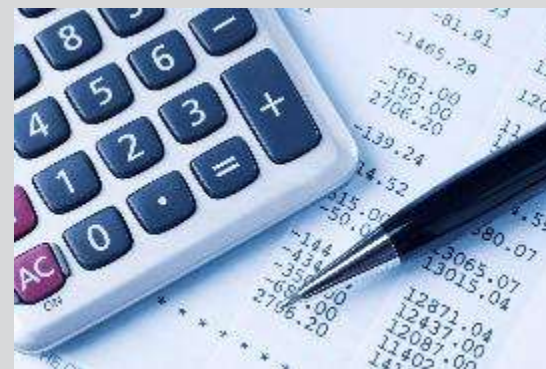
Cost information derived from Nelson Electric and others