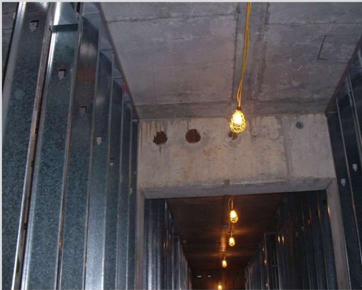
Incandescent lamps (100W or 150W) suspended from the slab deck at a 10' x 10' grid. (Smith, 2007)