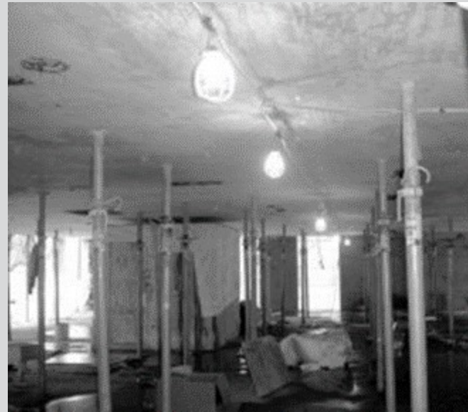
Suspended compact fluorescent lamps, (Clear-Vu Lighting, www.clearvulighting.com )