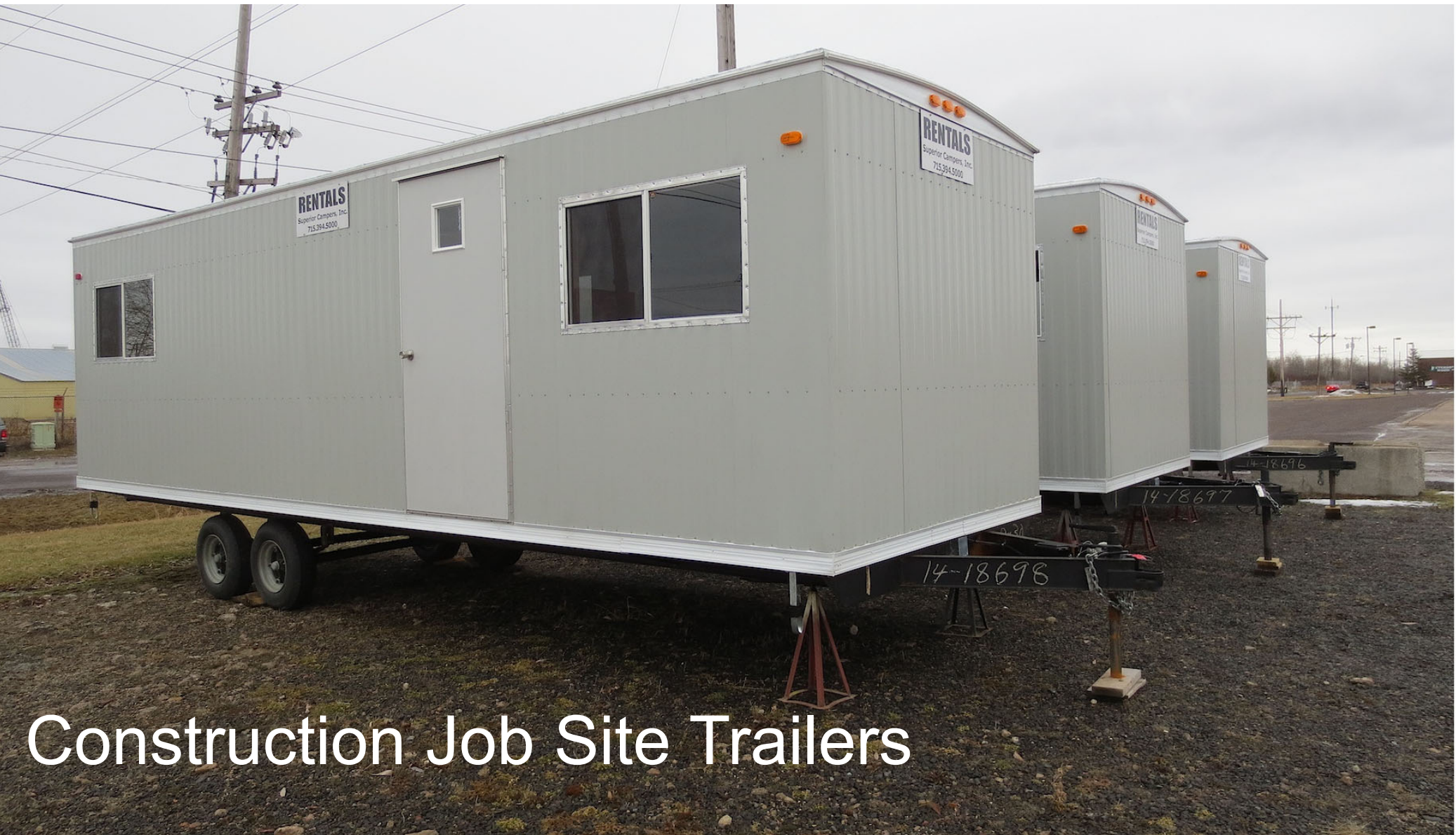
Construction Job Site Trailers